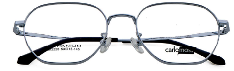
ZX2225 | 53 | 18 | 145 |