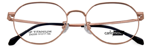
ZX2220 | 51 | 17 | 145 |