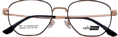
ZX2227 | 53 | 18 | 145 |