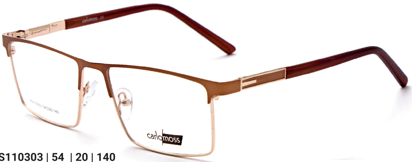
AS110303 | 54 | 20 | 140 C3