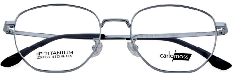
ZX2227 | 53 | 18 | 145 |