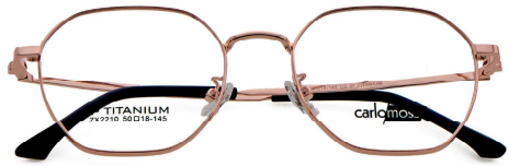
ZX2210 | 56 | 18 | 145 |