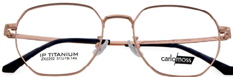
ZX2202 | 51 | 18 | 145 |