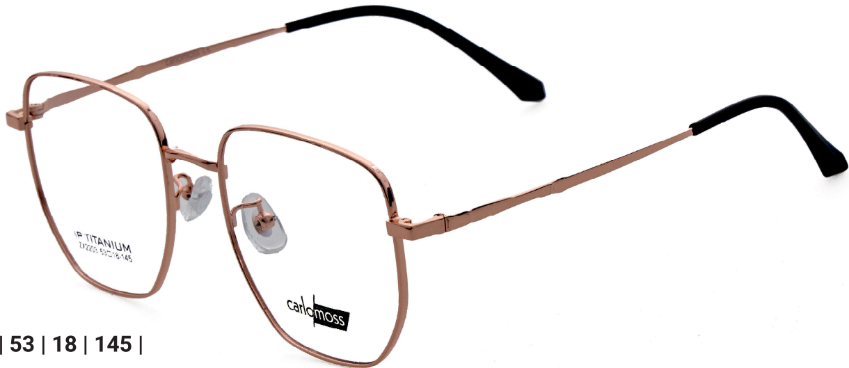
ZX2203 | 53 | 18 | 145 |