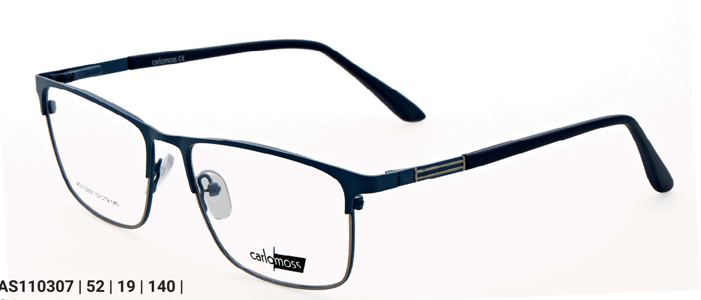
AS110307 | 52 | 19 | 140 | C4