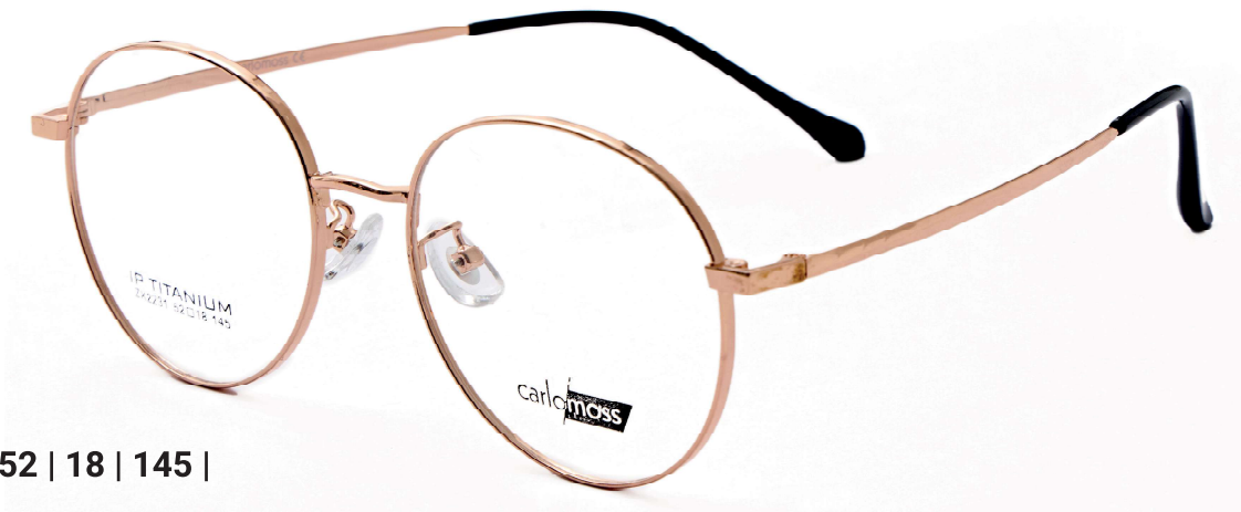
ZX2231 | 52 | 18 | 145 | C1